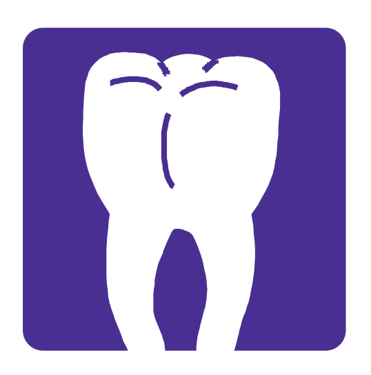
We will look at your teeth.