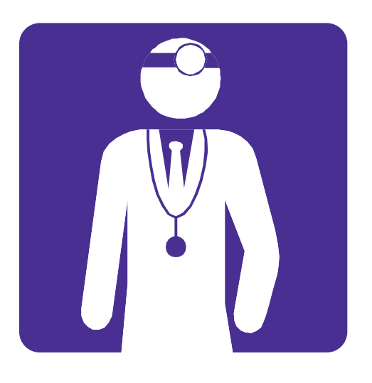
Our doctor will take your pulse.