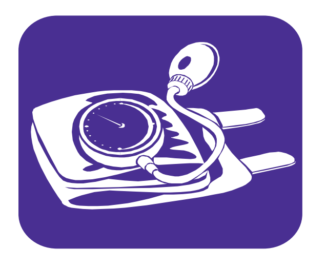
We will take your blood pressure.