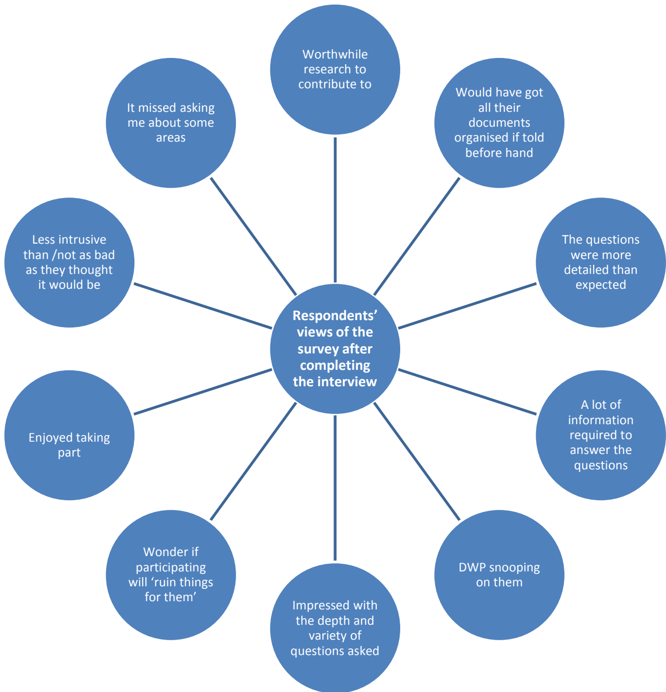
Figure A.1 Interviewers' views on respondent's general impression of the FRS after participating in the interview

The focus groups revealed that the factors that affect the information provided in the FRS fall under three areas: